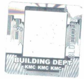
Asst Engg/Executive Engg by order (Municipal Commissioner) Executive Engineer (Civil) Building Department / Borough-XII The Kolkata Municipal Corporation

(Signature and designation of the Officer to whom powers have been delegated)